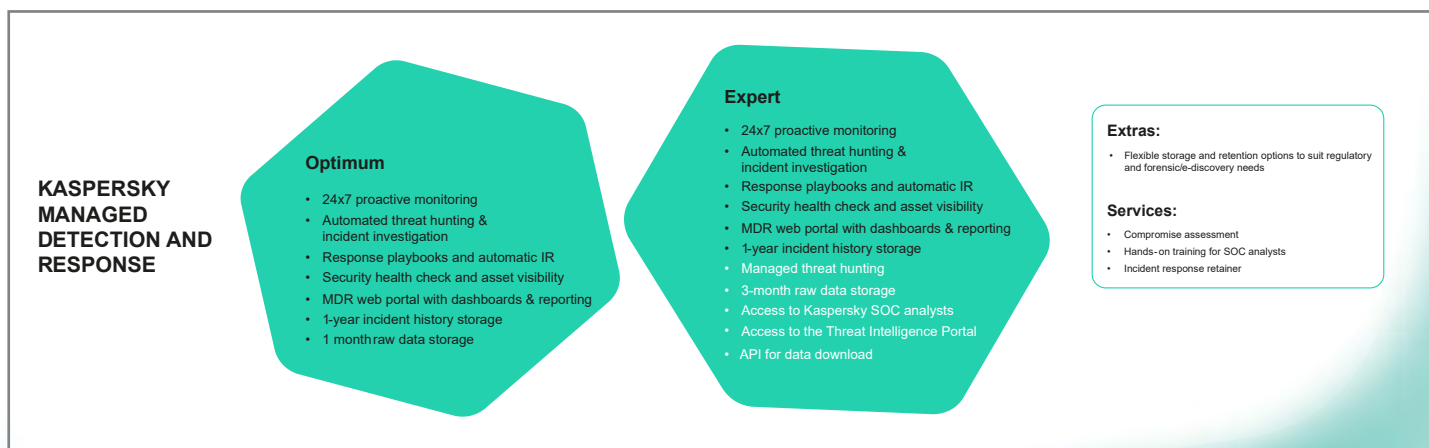
Figure 2. Kaspersky MDR tiers

Kaspersky MDR features two tiers to suit the needs of organizations of every size and industries with varying IT security maturity levels (Figure 2). Kaspersky MDR Optimum instantly raises your IT security capability without the need to invest in additional staff or expertise and provides resilience to evasive attacks through its fast, turnkey deployment. Kaspersky MDR Expert includes all the features of Optimum and provides extended functionality and flexibility for mature IT security teams, enabling them to offload incident triage and investigation processes to Kaspersky and focus their limited in-house IT security resources on reacting to the critical outcomes delivered.